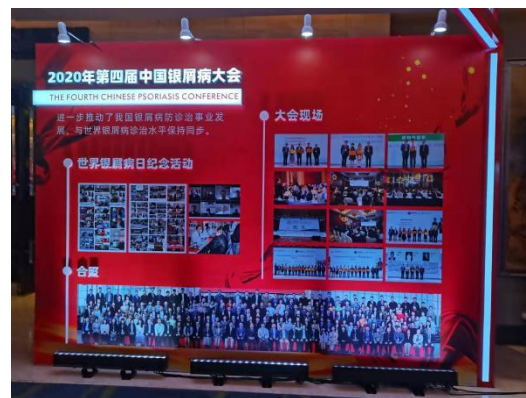
2017-2020 Review of the former 4 CPCs